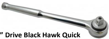
1/2" Drive Black Hawk Quick Release Ratchet TP2019026