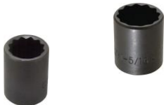
15/16" Proto 12 Point Impact Socket TP2019027 1-5/16" Proto 12 Point Impact Socket TP2019028