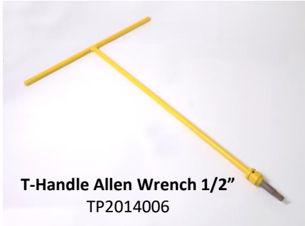
T-Handle Allen Wrench 1/2" TP2014006