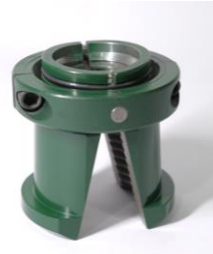
Duck Bill Seat Puller Green TP2012109