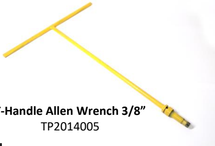
T-Handle Allen Wrench 3/8" TP2014005