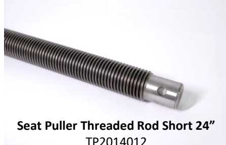
Seat Puller Threaded Rod Short 24" TP2014012 Seat Puller Threaded Rod Long 36" TP2014042