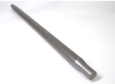
3/4" Packing Bar for CAT Fluid End TP2014076 Packing Bar for G.Denver 1/2" on Both Ends TP2019022