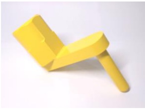
Speed Wrench Short 3" TP2014003