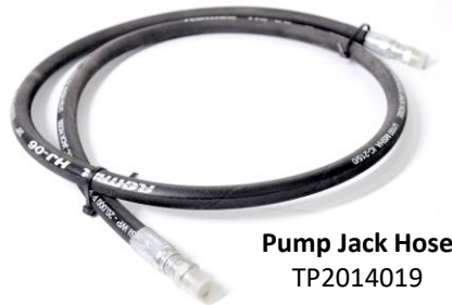
Pump Jack Hose TP2014019