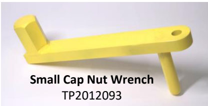
Small Cap Nut Wrench TP2012093