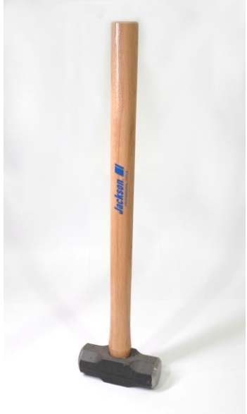
6lb Sledge Hammer with 24" Handle TP2017074