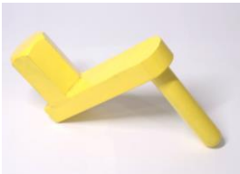
Speed Wrench Short 2" TP2014004