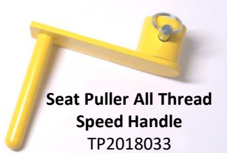
Seat Puller All Thread Speed Handle TP2018033