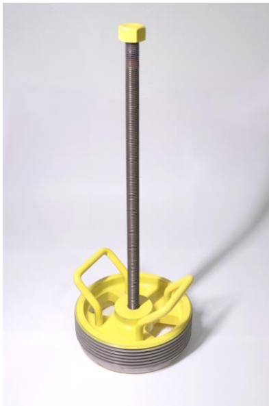
Heavy Duty Plunger Pusher for G.Denver TP2014059