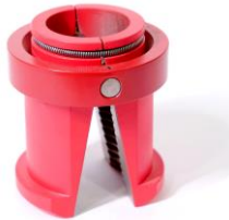
Duck Bill Seat Puller Red TP2012108