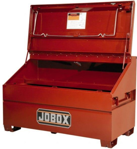
60" Wide 30" Deep X 39-1/2" High Job Site Slope Lid Box TP2019023