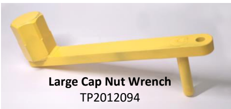
Large Cap Nut Wrench TP2012094