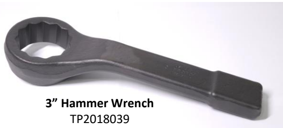
3" Hammer Wrench TP2018039