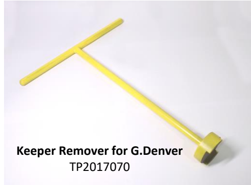
Keeper Remover for G.Denver TP2017070