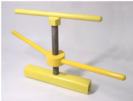
Crush Cap Puller With Handle Nut TP2012086N