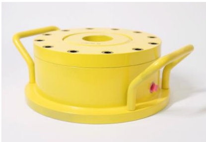
Seat Puller Pancake Cylinder TP2014043