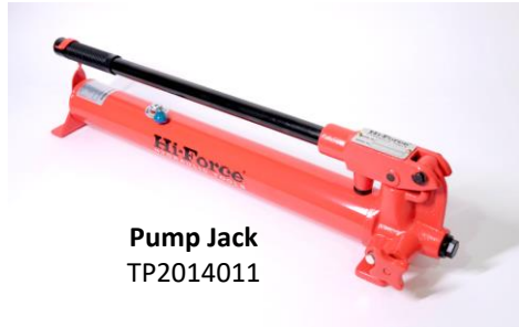
Pump Jack TP2014011