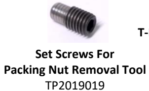
Set Screws For Packing Nut Removal Tool TP2019019